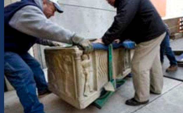
Above: Workers move the sarcophagus from the Roger Williams Park Museum of Natural History to The RISD Museum.