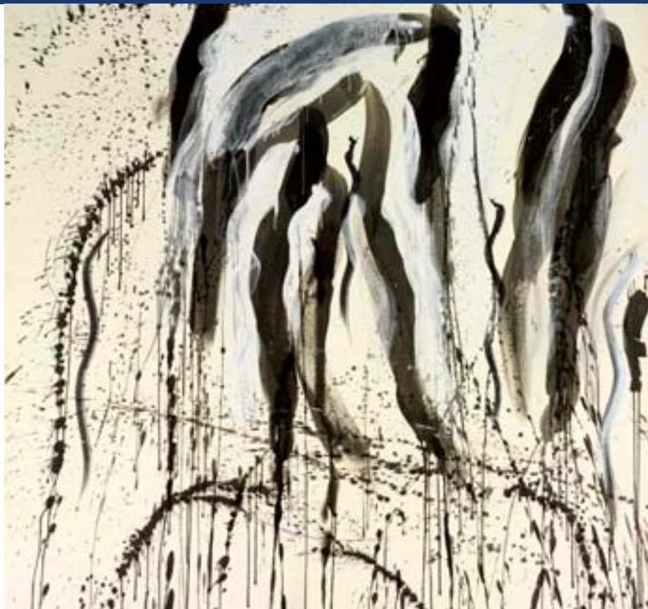
Pat Steir, The Austria Group. No. 2, 1991.

Visitors entering the main exhibition space will first encounter Steir's quiet, early works. Having written poetry before learning to paint, Steir considers drawing and writing as one and the same. In 1975, Steir narrowed her research